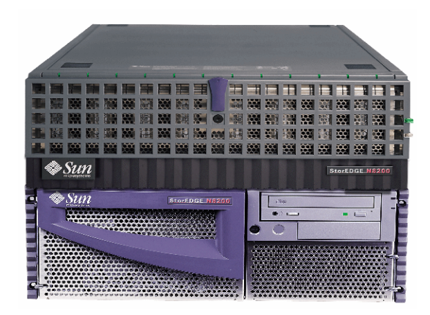
Figure 1. Sun StorEdge™ N8200 filer